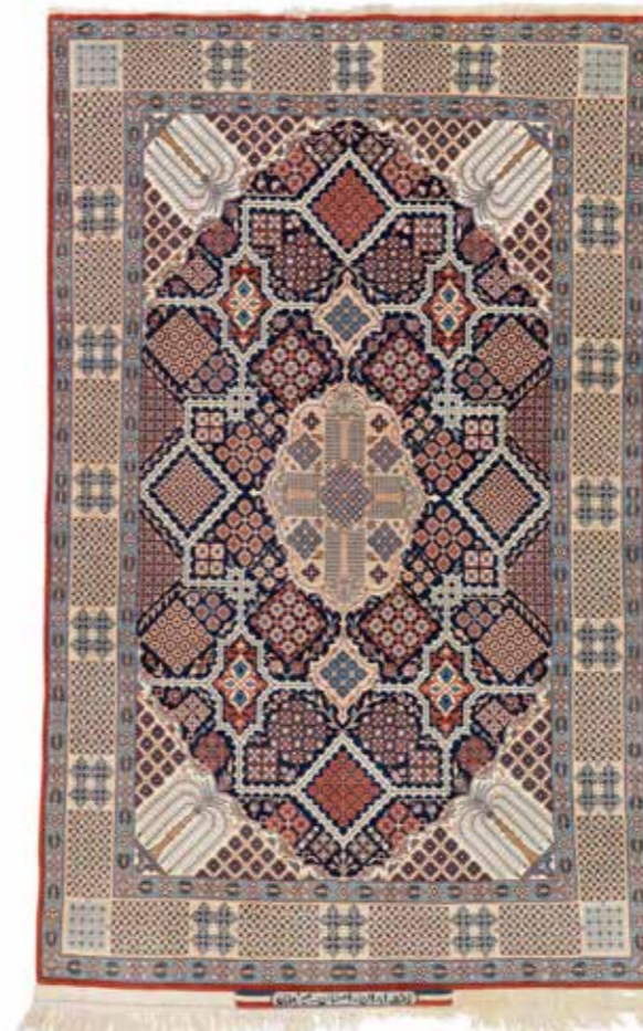
90 A signed Seirafian Isfahan rug, Persia. Medallion design on an ivory field of flowers, branches and foliage. Knotted with kork wool on silk warps. Sign.: Made for Seirafian Isfahan Iran. C. 1.2 mio. kn. pr. sqm. C. 1960. 170 x 102 cm. DKK 25,000 / € 3,350