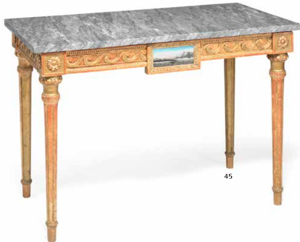
45 A large Gustavian giltwood console table with gray marble top, front adorned with painting showing mountain scene. Stockholm, early 18th century. H. 79 cm. W. 117 cm. D. 58 cm. DKK 30,000–40,000 / € 4,050–5,400