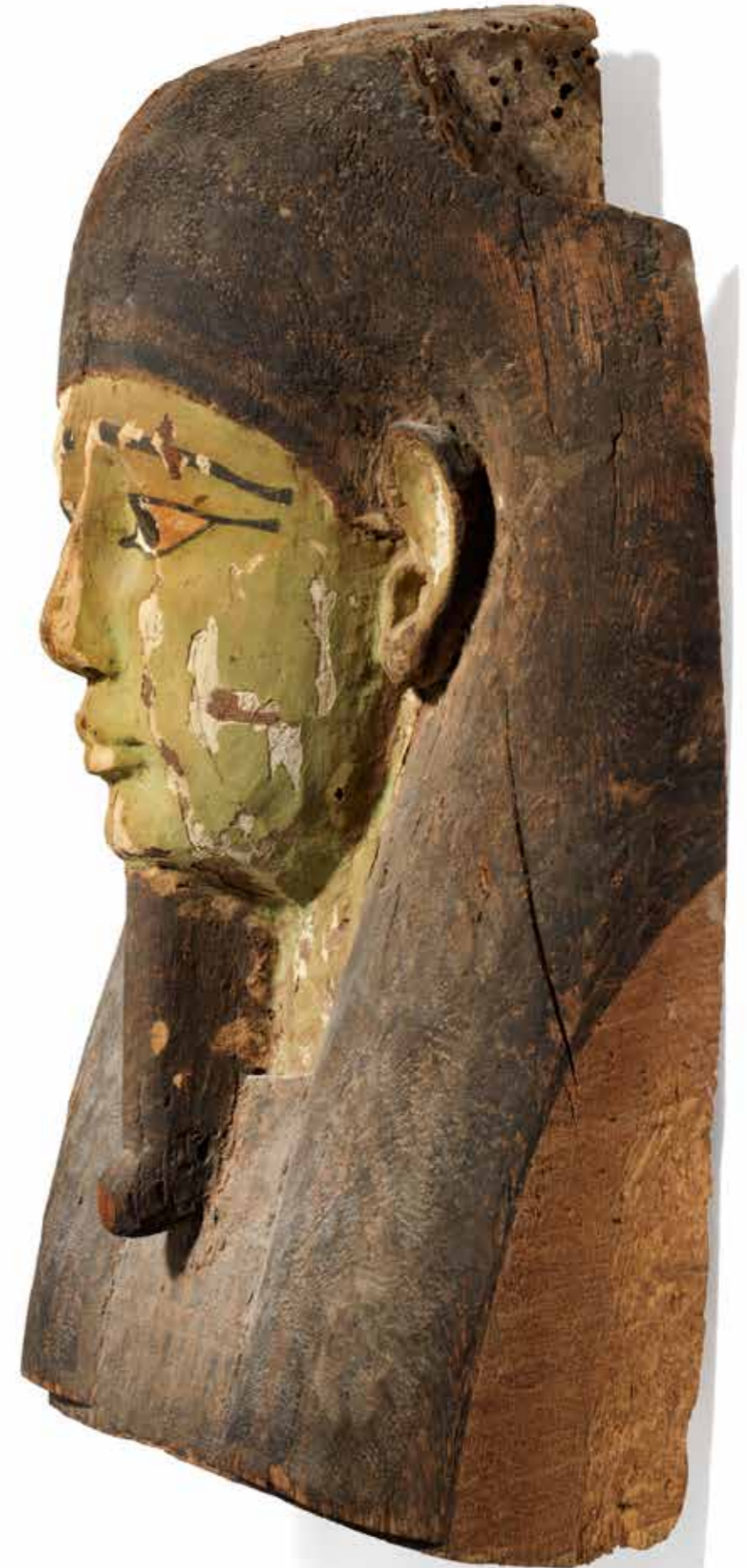
15 An Egyptian wood mummy mask of a man. From the lid of a coffin, wearing a broad wig, braided beard with curled tip, collar with remains of grid pattern, the face is green and with kohl painted eyes. Late Third Intermediate - Late Period, 25th-26th Dynasty, c. 747-525 B.C. H. 53 cm. B. 38 cm. Provenance: From a Danish private collection and according to information acquired in 1975. DKK 40,000-50,000 / € 5,400-6,700