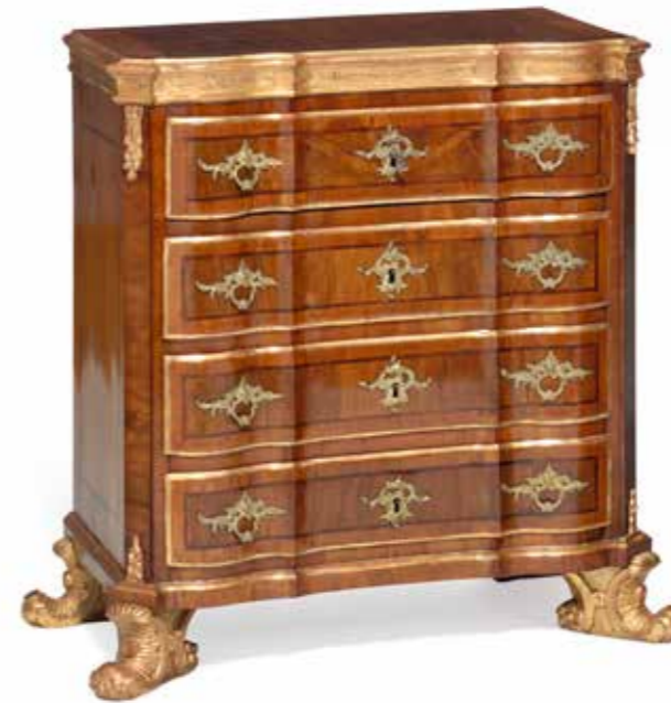
23 MATHIAS ORTMANN, WORKSHOP OF b. 1692, d. Copenhagen 1757 A pair of Danish Rococo walnut and giltwood commodes each with four bracket front drawers, gilt bronze mounting and sleigh feet. Mid-18th century. H. 80 cm. W. 82 cm. D. 45 cm. (2) DKK 75,000–100,000 / € 10,000–13,500