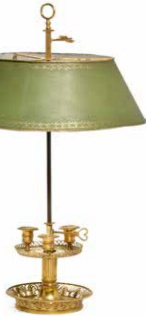
44 A pair of Louis XVI gilt bronze bouillotte lamps with adjustable green painted metal shades. Late 18th century/ early 19th century. H. 65 cm. Diam. 42 cm. (2) DKK 45,000–50,000 / € 6,050–6,700