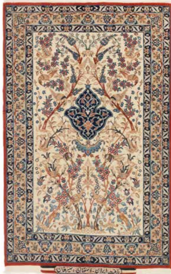
82 A signed Seirafian Isfahan rug, Persia. Medallion design. Knotted with kork wool on silk warps. Sign.: Seirafian Isfahan Iran. C. 650.000 kn. pr. sqm. C. 1970. 180 x 106 cm. DKK 20,000–25,000 / € 2,700–3,350