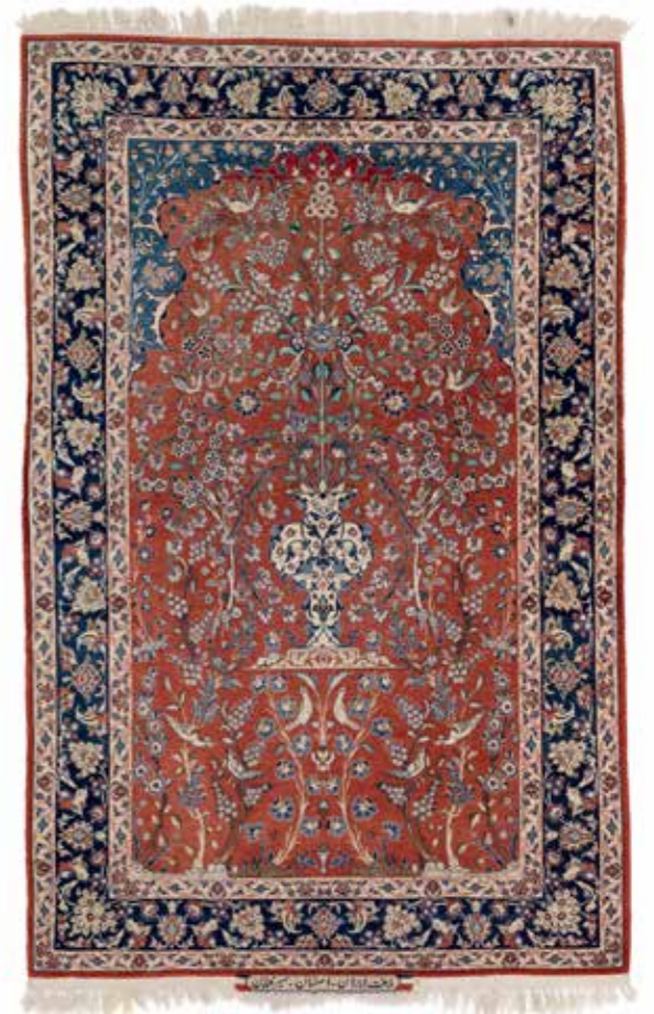
84 A signed Seirafian Isfahan rug, Persia. Design with flowervase, trees and bird motifs on a red field. Knotted with kork wool on silk warps. Signed: Seirafian Isfahan Iran. C. 1.1 mio. kn. pr. sqm. 1950-1960. 110 x 170 cm. DKK 15,000–20,000 / € 2,000–2,700