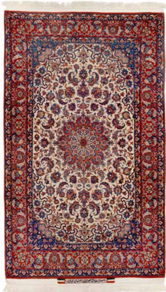
89 A signed Seirafian Isfahan rug, Persia. Medallion design on a green field. Sign.: Seirafian Isfahan Iran. Knotted with kork wool on silk warps. C. 1 mio. kn. pr. sqm. C. 1960. 181 x 103 cm. DKK 20,000 / € 2,700