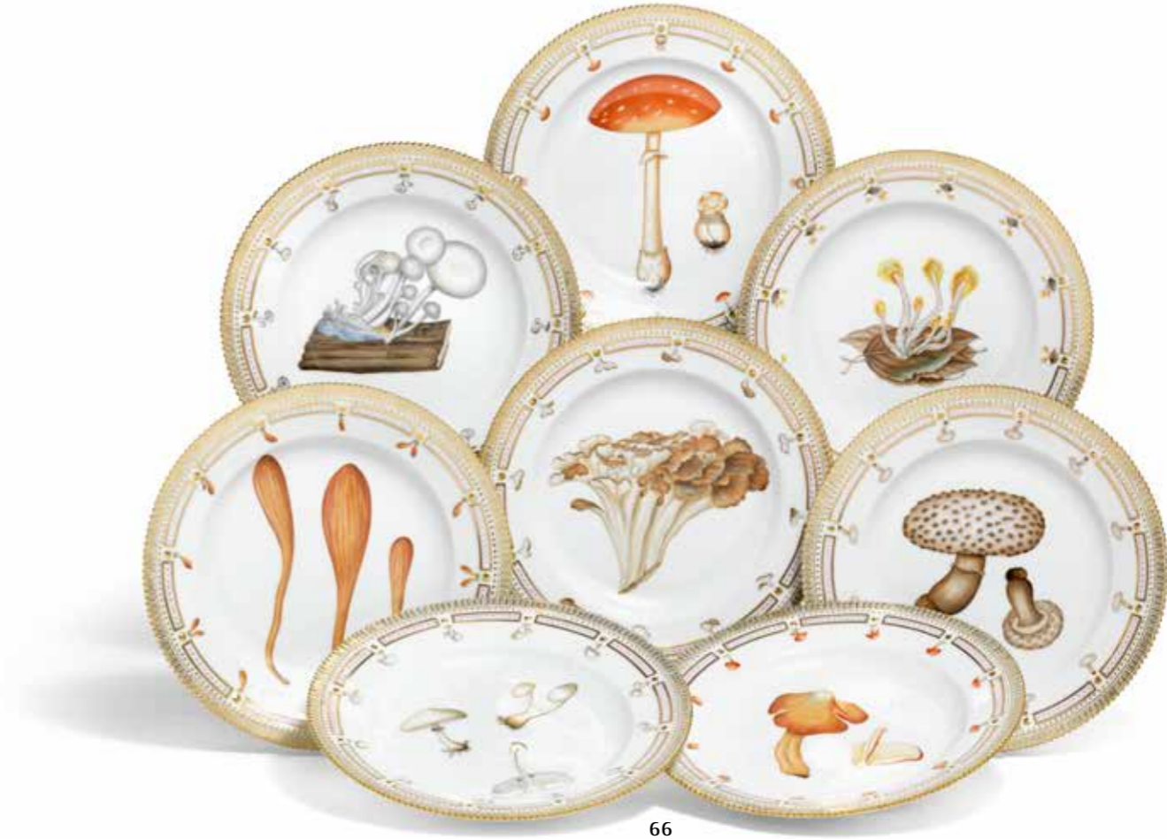
65 "Flora Danica Fungi" eight porcelain dinner plates with pierced rim, decorated in colours and gold with fungi. 381. Royal Copenhagen. Diam. 28 cm. (8) DKK 60,000–80,000 / € 8,050–11,000