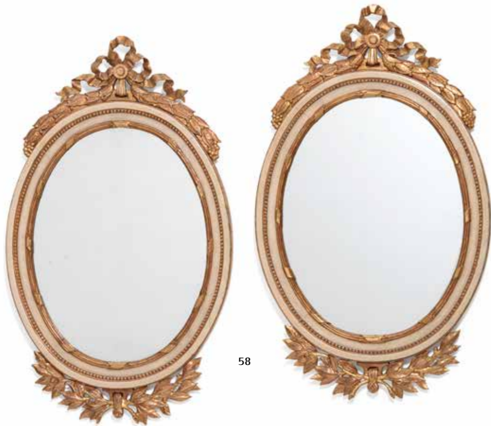
58 A pair of Danish Louis XVI oval painted and giltwood mirrors, carved with openwork bow and foliage. Late 18th century. H. 98 cm. W. 58 cm. (2) DKK 20,000–30,000 / € 2,700–4,050