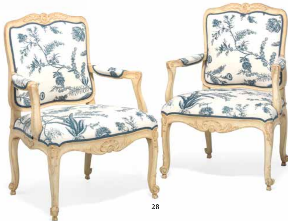
28 A pair of large Swedish painted Rococo armchairs, square backs carved with cartouches and foliage, padded armrests, curved seats with shell and foliage carvings, cabriole legs with volutte endings. Stockholm, mid-18th century. (2) DKK 50,000–60,000 / € 6,700–8,050