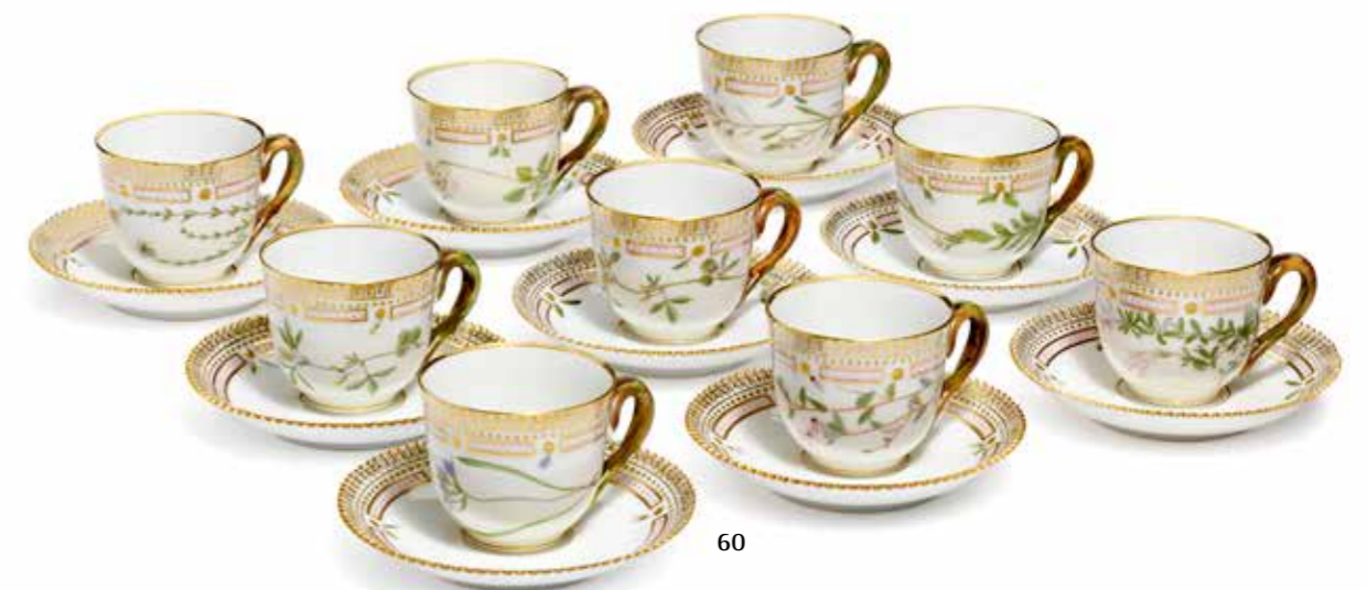
60 "Flora Danica" nine porcelain mocha cups and saucers decorated in colours and gold with flowers, handles in the shape of twisted twigs. 3618. Royal Copenhagen. (9) DKK 20,000–25,000 / € 2,700–3,350