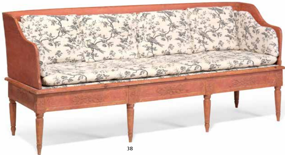
38 A Gustavian red painted sofa, carved with flowers and leaves, six round fluted and tapering legs. Late 18th century. H. 86 cm. L. 200 cm. D. 60 cm. DKK 25,000–30,000 / € 3,350–4,050