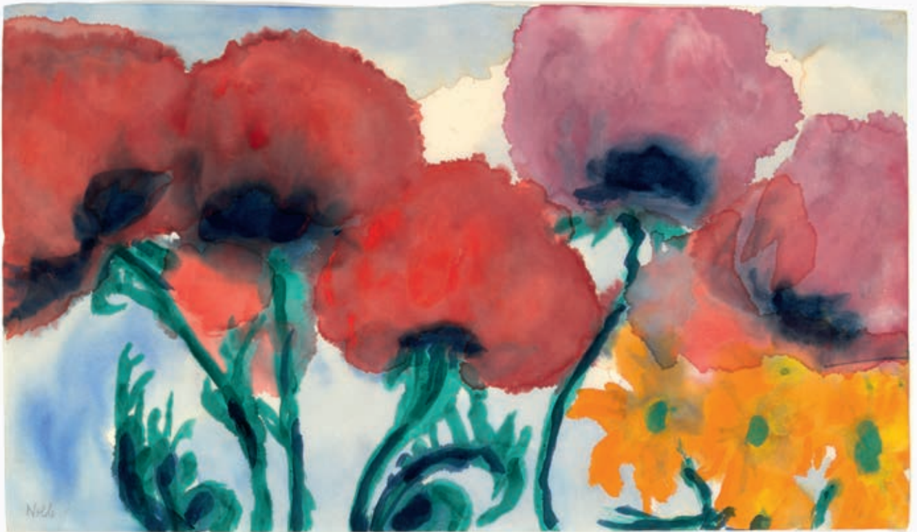
Emil Nolde: "Mohnblumen" (Poppies). Signed Nolde. Watercolour on paper. Visible size 26 x 45.5 cm. Vurdering: DKK 600,000-800,000 / € 80,500-105,000.