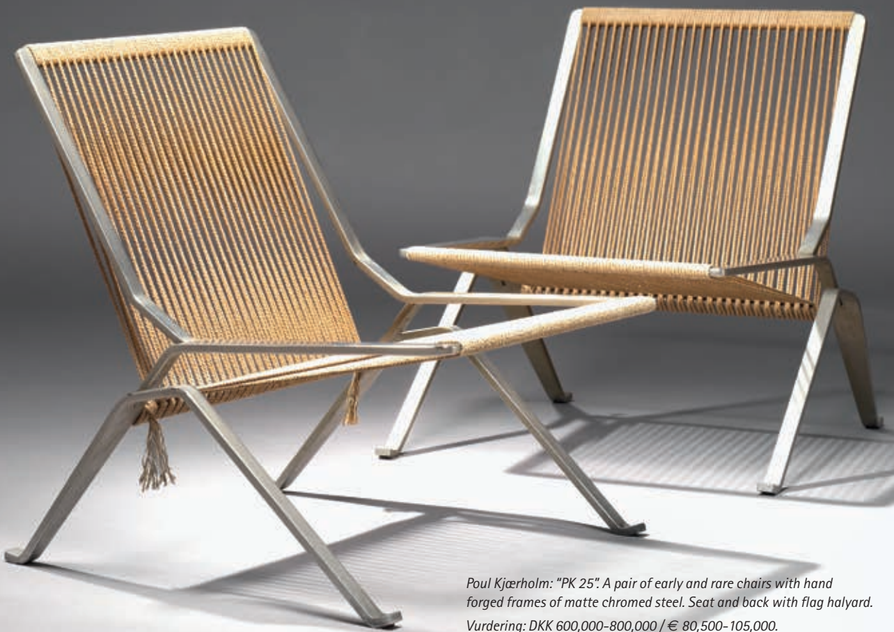
Poul Kjærholm: "PK 25". A pair of early and rare chairs with hand forged frames of matte chromed steel. Seat and back with flag halyard. Vurdering: DKK 600,000-800,000 / € 80,500-105,000.