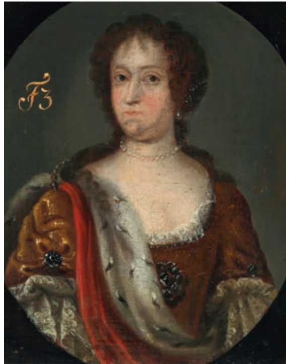
160 Queen Sophie Amalie of Brunswick - Lüneburg