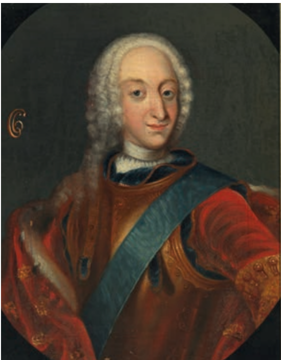
160 Frederik VI