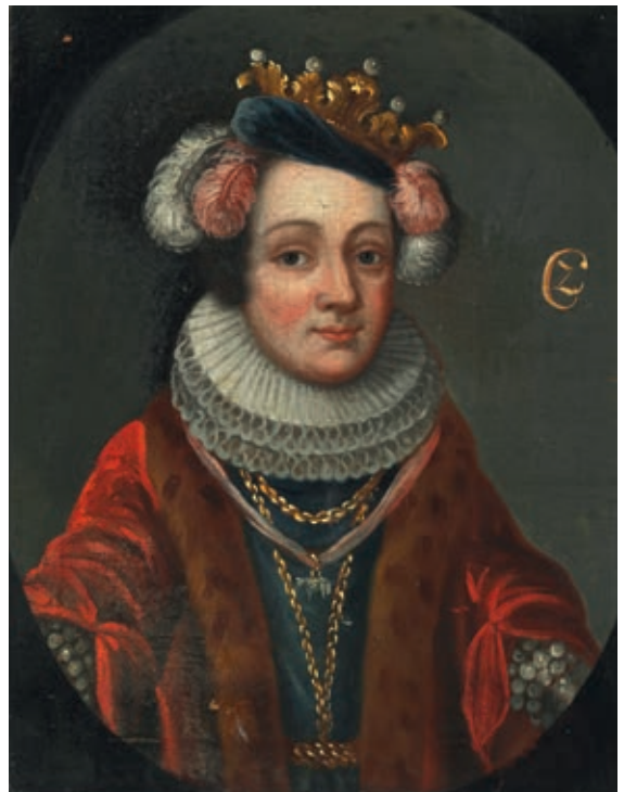
Queen Christine of Saxony