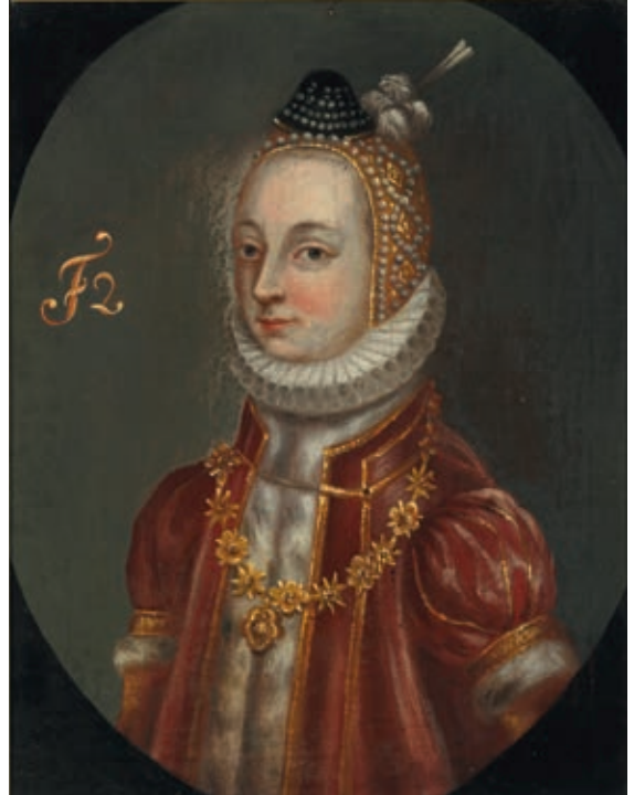
160 Queen Sophie of Mecklenburg