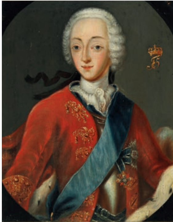
160 Frederik V