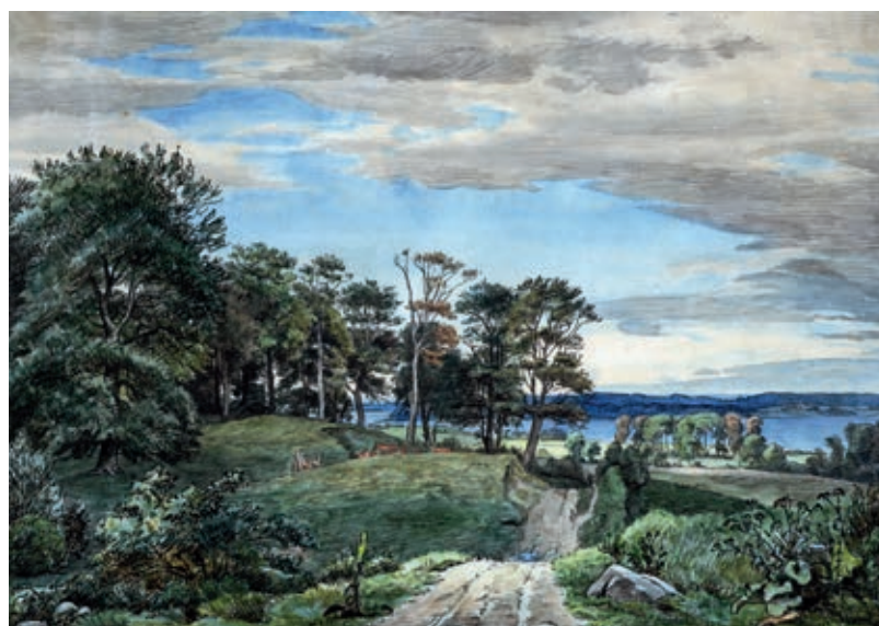
P.C. Skovgaard: A landscape near Fredensborg, Sjælland. (1841). Watercolour. Helsingør Municipality Museums.