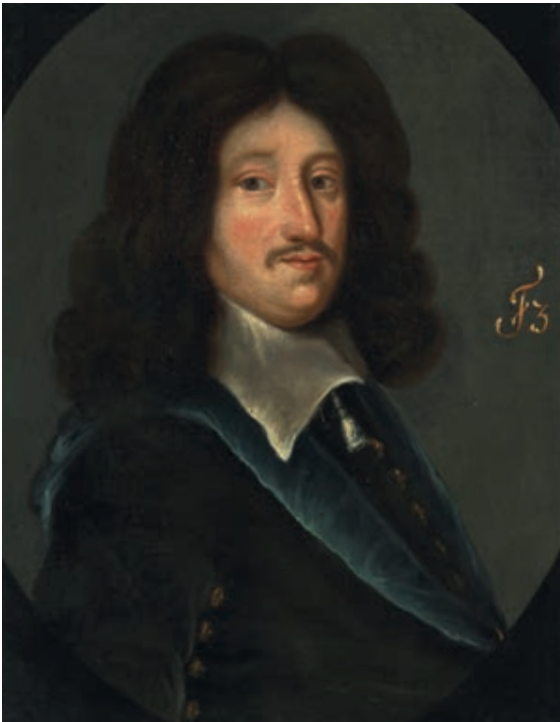
160 Frederik III