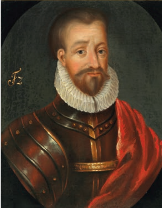
160 Frederik II