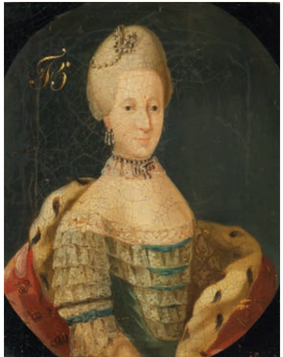
160 Queen Juliane Marie of Brunswick - Wolfenbüttel