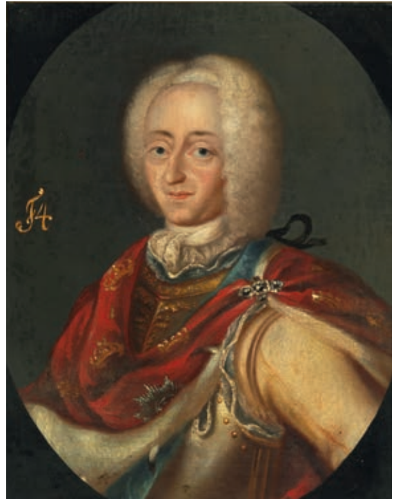
160 Frederik IV