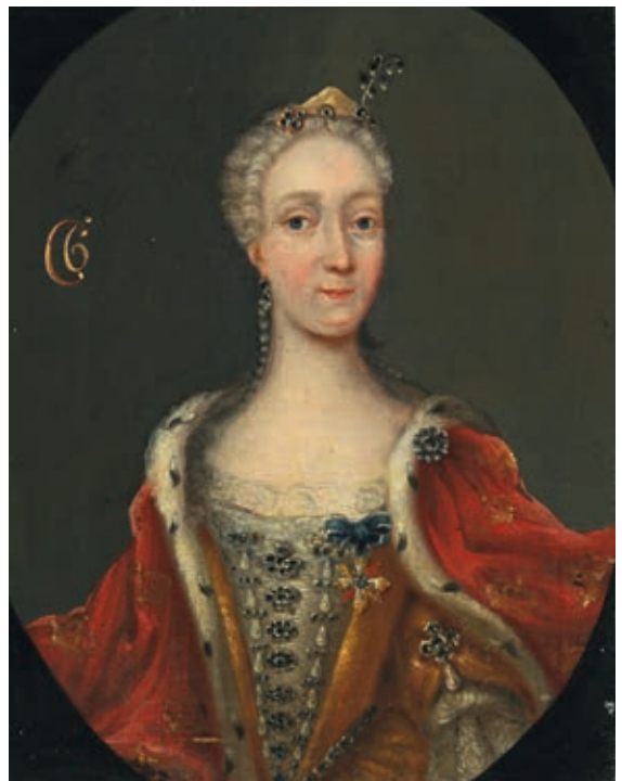
160 Queen Sophie Magdalene of Brandenburg