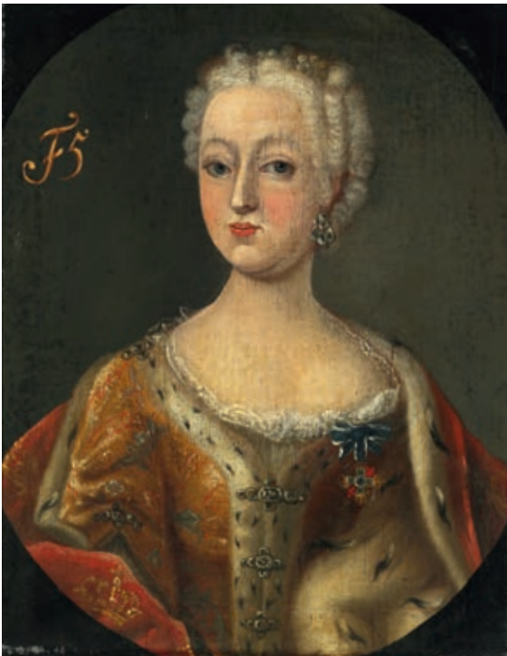
160 Queen Louise of England