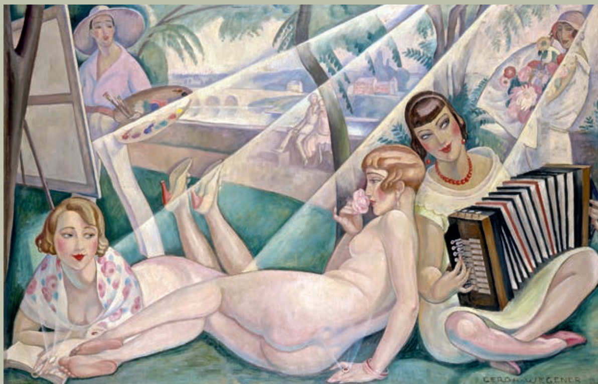
"A Summer Day". Oil on canvas. 130 x 200 cm. Private collection.