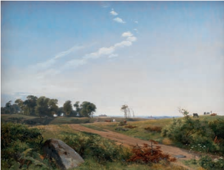
Johan Thomas Lundbye: Open landscape in northern Sjælland. (1842). National Gallery of Denmark.