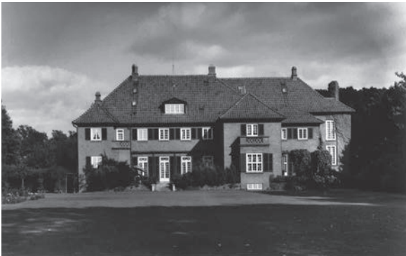
Ørehøj in Hellerup