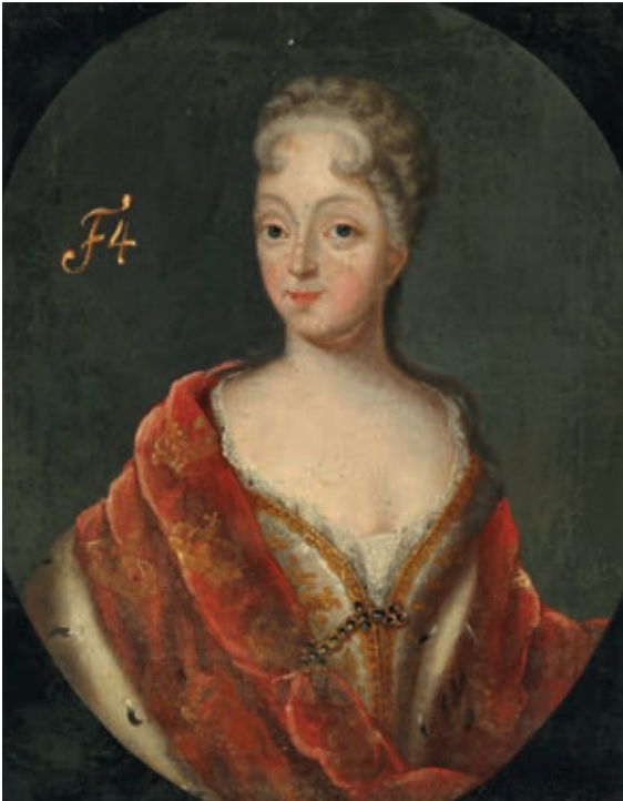
160 Queen Louise of Mecklenburg - Güstrow